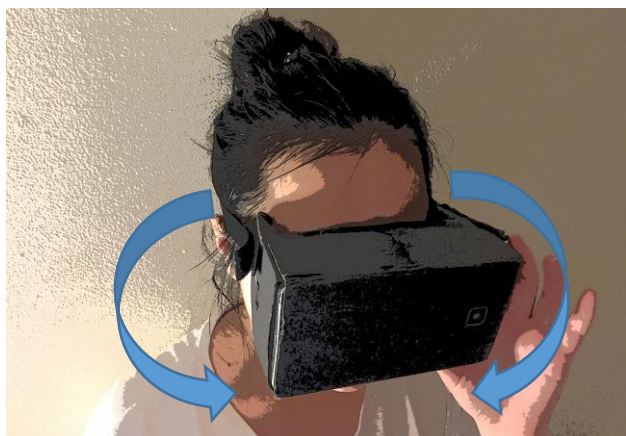
Figure 2. Head gesture simulating touch & swipe to navigate.

Navigation between the different categories can be achieved by aiming at the right or left arrow and pressing the magnet switch. Alternatively, a gesture (Figure 2) can be performed after pressing and holding the magnet switch while aiming at the screen and moving the head to the left or right quickly.